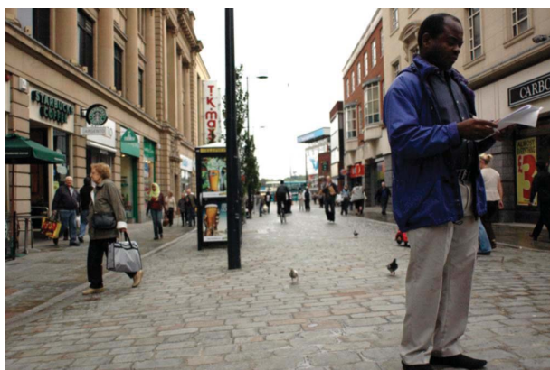
FIGURE 3. Walking in Derby, 2008.

unknown places were discovered and known places re-discovered. For co-walkers and refugees alike, this meant that the city was seen through fresh eyes. For example, passing an unassuming convenience and grocery store, one walker, an unaccompanied young asylum seeker, was encouraged to talk about the importance of particular stores for them: