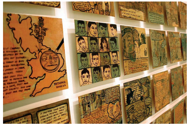
FIGURE 8. Land of dreams , by Paul Gent and Dreamers Youth Group, 2008.

Through Erlebnis (inner lived experience or 'lived moments' [Lopez 1999, 70]) and Erfahrung (historical experience grounded in cumulative wisdom – for example, in storytelling; see Benjamin 1992, 83–107), the processes involved in coming into a sense of belonging are deeply relational. Friends, networks and other sources of social associations are crucial. But the physical landscapes anchor these relational ties and can serve as transitional objects. As one walker exclaimed, 'This rain in Africa we would have rejoiced – it's very lucky to have this amount of rain'. In negotiating the real and the imagined space of the landscape of the cities, the relational aspects of the walks were foregrounded both at the time and in the subsequent art/research workshops and the work produced for the exhibition. Art/research workshops were facilitated by community arts organisations Charnwood Arts, City Arts, Soft Touch and the Long Journey Home with asylum seekers/refugees. A group of professional artists worked together and supported the art workshops in Nottingham, Derby and Loughborough. The workshops were spaces where the ethno-mimetic process unfolded. Being inspired by the walks, post-walk discussions and focus groups (some of the latter undertaken in the creative space of the art making) led to the themes and particular experiences