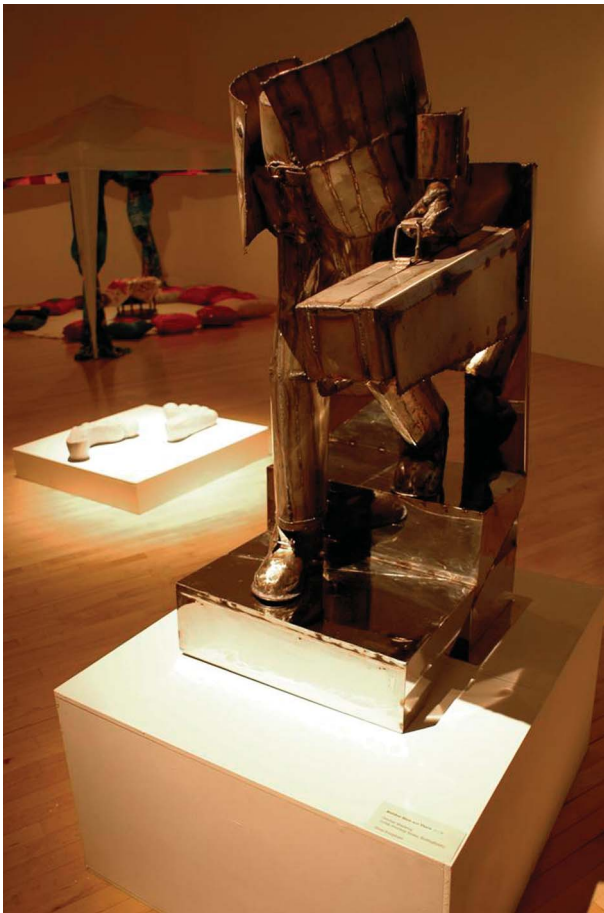
FIGURE 5. Neither here nor there , by Obediar Madziva, 2008 (photo: Aria Ahmed).

good at it. And all the festivities that we had [laughs] I had to make the best of them.